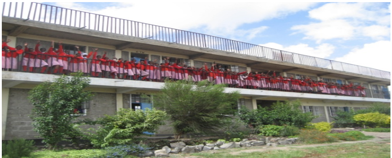
New Classrooms - 2010